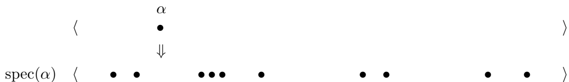
Figure A. Each real number \alpha determines \text{spec}(\alpha) , a countably infinite subset of the reals.